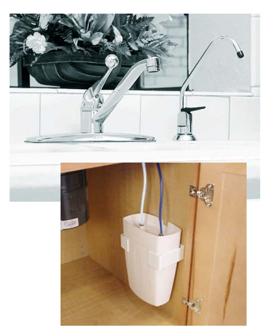
This product can be used only with the supplied faucet and is not designed to be used in constant pressure applications, such as ice makers or fountains.

Under-sink Adapter Kits (for use with the Aquasana AQ-4000