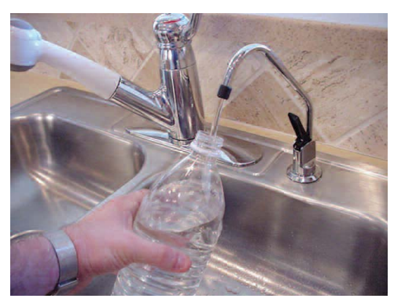
With Aquasana, you can bottle your own!